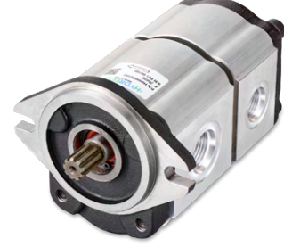
Aluminum gear pumps - multiple